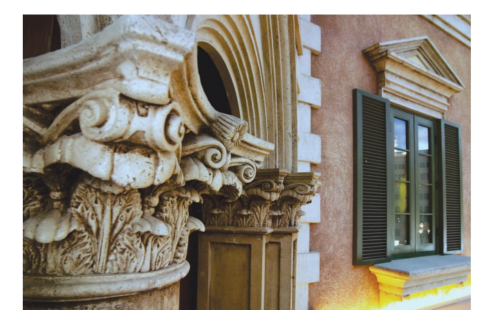
COLUMNS, ARCHES, QUOINS & PEDIMENTS

Formglas Products Ltd. 181 Regina Road Vaughan, Ontario, Canada L4L 8M3 T: 1.866.635.8030 F: 416.635.6588