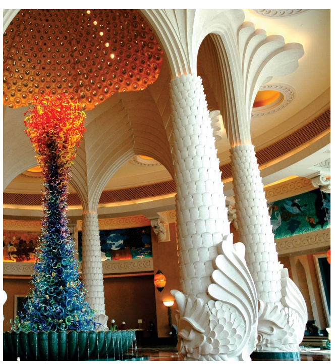
SCULPTED COLUMNS, DOME & MOLDINGS

To view photos of QuarryCast® applications, or to contact a local Formglas® representative, visit www.formglas.com.