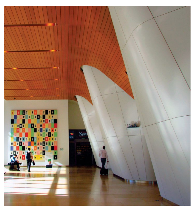
INTEGRALLY COLORED & TEXTURED CURVED & ANGULAR PANELS