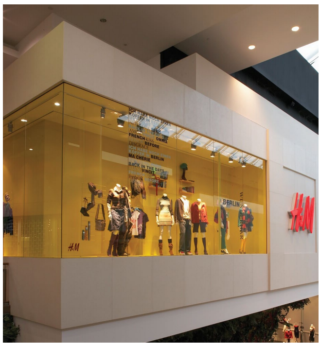
WALL VENEER PANELS