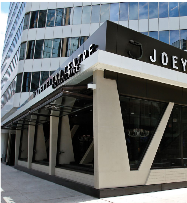
DECORATIVE WISHBONE COLUMNS & BASE PANELS