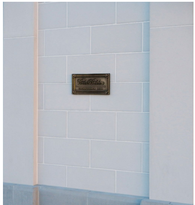
DECORATIVE WALL PANELS & TRIM ELEMENTS