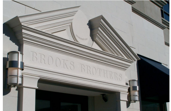
BRANDED ENTRY PEDIMENT

Formglas Products Ltd. 181 Regina Road Vaughan, Ontario, Canada L4L 8M3 T: 1.866.635.8030 F: 416.635.6588 Web: formglas.com Email: info@formglas.com