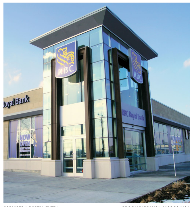
CORNICES & PORTAL ENTRY

To view photos of Formglas® FRP applications, or to contact a local Formglas® representative, visit www.formglas.com.