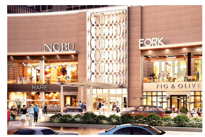
PRE-FINISHED GOLD + SILVER METALLIC FRP LINKED SCREEN

Formglas Products Ltd. 181 Regina Road Vaughan, Ontario, Canada L4L 8M3 T: 1.866.635.8030 F: 416.635.6588